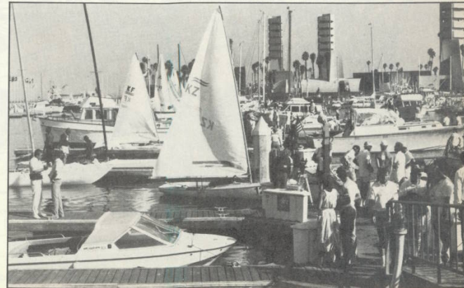
The competitors' enclosure at Long Beach turned into a security camp for the Games